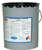
Mar-flex LiteFUSION (Water-Based) RWW-01-5 5 Gallon Bucket Each or 36/Pallet

LiteFUSION is an economical water-based acrylic waterproofing membrane for use when hydrostatic pressure exists. It has the ability to bridge cracks that might later develop in a foundation, and can protect from the dangers of moisture, which cause mold and mildew. Mar-flex LiteFUSION is specifically designed for waterproofing precast, poured and masonry foundation walls. Mar-flex LiteFUSION is a spray-on membrane, so it dries as a seamless, monolithic coating.