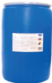
Mar-flex LiteFUSION (Water-Based) RWW-01-55 55 Gallon Drum Each or 4/Pallet